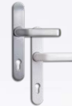
ES 2641 SAA silver or white internal lever handle with spring return