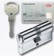
ES 2217 BKS Livius security cylinder with registration card