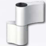
ES 2420 2 piece flag hinge in SAA Silver or White